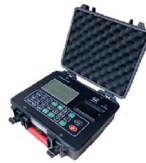
PWHY680 Control remoto con impresora y visor / Remote control with printer and display