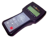
PWHY280 Control remoto simple con visor / Simple remote control with Display