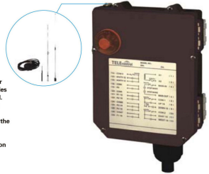
MODEL: EF24-RXC ITEM CODE: 924-100-103 Dimension: 210x162x107mm Weight: 1220g

Safety of Receiver Operation The system is with explosion-proof casing and inner electronic circuit safe solution and it meets ATEX rules and strictly complies with explosion-proof standard. The emergency stop circuit and control with double redundant and safety relay with forcibly guided (mechanically linked) contacts which make it meets the E-stop class Cat 3 in The European mechanical equipment standard. To ensure safety, continuous wireless communication device make receiver stop passively when the radio signal is disconnected or is interfered. Buttons can be programmed to interlock to avoid opposite operation.