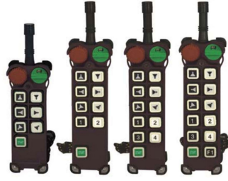
EF24-6S/D EF24-8S/D EF24-10S/D EF24-12S/D