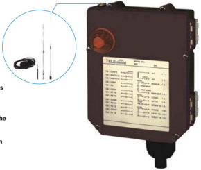
MODEL: EF24-RXC ITEM CODE: 924-100-103 Dimension: 210x162x107mm Weight: 1220g

Safety of Receiver Operation The system is with explosion-proof casing and inner electronic circuit safe solution and it meets ATEX rules and strictly complies with explosion-proof standard. The emergency stop circuit and control with double redundant and safety relay with forcibly guided (mechanically linked) contacts which make it meets the E-stop class Cat 3 in The European mechanical equipment standard. To ensure safety, continuous wireless communication device make receiver stop passively when the radio signal is disconnected or is interfered. Buttons can be programmed to interlock to avoid opposite operation.